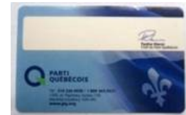
Laminated (Glossy finish)