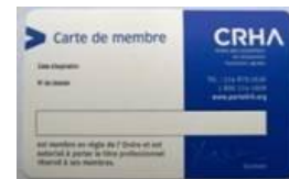
Polyester (matte finish)